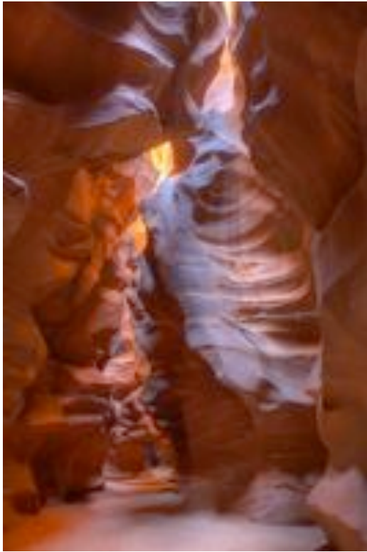
Canyon Wall Abstract #2, Small Color A HM by Bob Benson