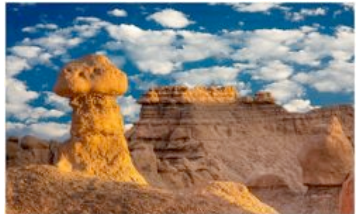
Goblin Valley