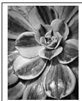
Monochromatic Patterns #1 Large Monochrome HM by Dennis Arendt

Small Color B not pictured: The Rugged West- HM by Joe Tarlos