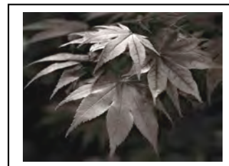
Light Play on Leaves Large Monochrome AW by Dennis Arendt