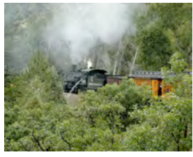
Steam Train Small Color A HM by Bob Stolt