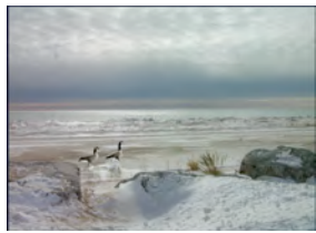
Winter Shore Light Large Color AW & BOS by Pat Centeno