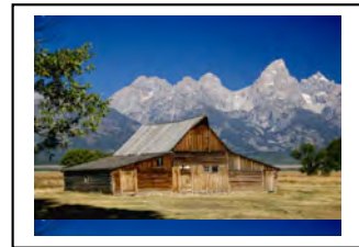
Teton Farm Scene Digital Slides HM