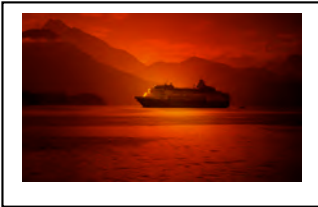
Sailing into the Alaskan Sunset Digital Slides AW by Dick Frieders