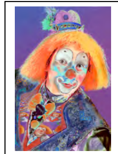
A Different Kind of Clown Small Color A HM