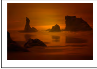
Oregon Coast at Sunset Digital Slides AW by Dick Frieders