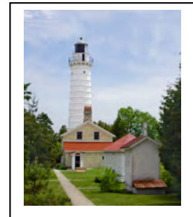
Cana Island Light Small Color A AW by Bob Stolt