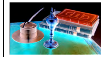
Desk Top Small Color B AW by Martha Kuzma