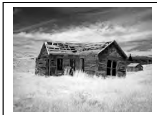
Ghost Town Small Monochrome AW & BOS